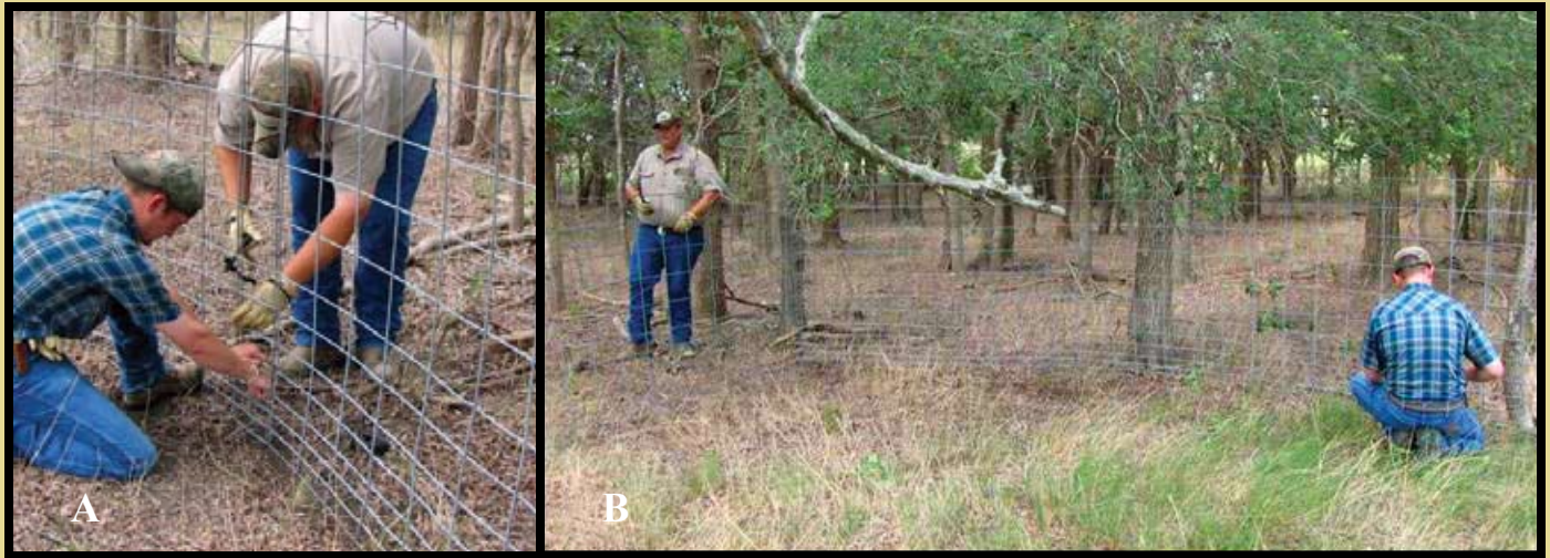
Figure 6. An extra pair of hands is helpful when attaching panels. One person holds the panels in place while the other secures them (A). After all panels are secured, the panels are pulled to their desired location (B).

Once the trap is in the desired shape and location, use T-posts to anchor the trap (Fig. 7). T-posts should be spaced approximately 4' apart. Feral hogs are extremely strong and will test the trap when captured. Do not assume that the trap can be overbuilt. A captured hog can do serious damage to even the sturdiest of traps, and those made of weaker materials may allow hogs to escape altogether. Always make traps as strong as possible.