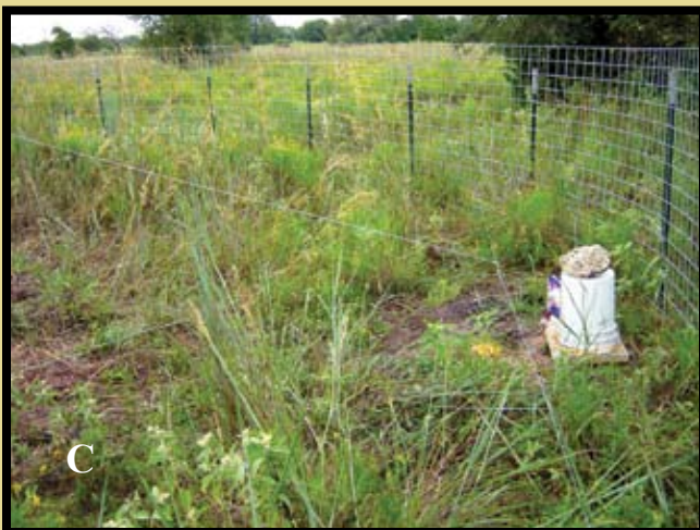
Figure 9. A board is used as a prop on a saloon type door (A). T-posts guide the wire from the prop to the back of the trap (B). The wire is then attached to another wire at the trigger (C). As hogs feed on the bait, the wire is stretched, and the prop pulls from the door.